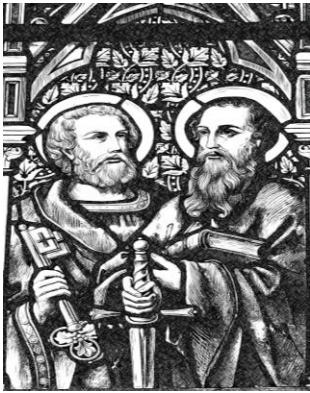
Saints Peter & Paul