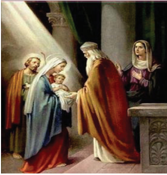
The Presentation of the Lord

1 st Reading: Malachi 3. 1-4 2 nd Reading: Hebrews 2.10-11, 13b-18 Gospel: Luke 2.22-40