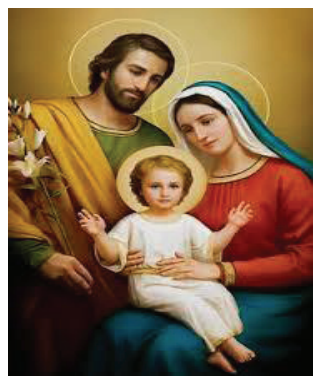
Feast of the Holy Family

1<sup>st</sup> Reading: 1 Samuel 1.20-22, 24-28